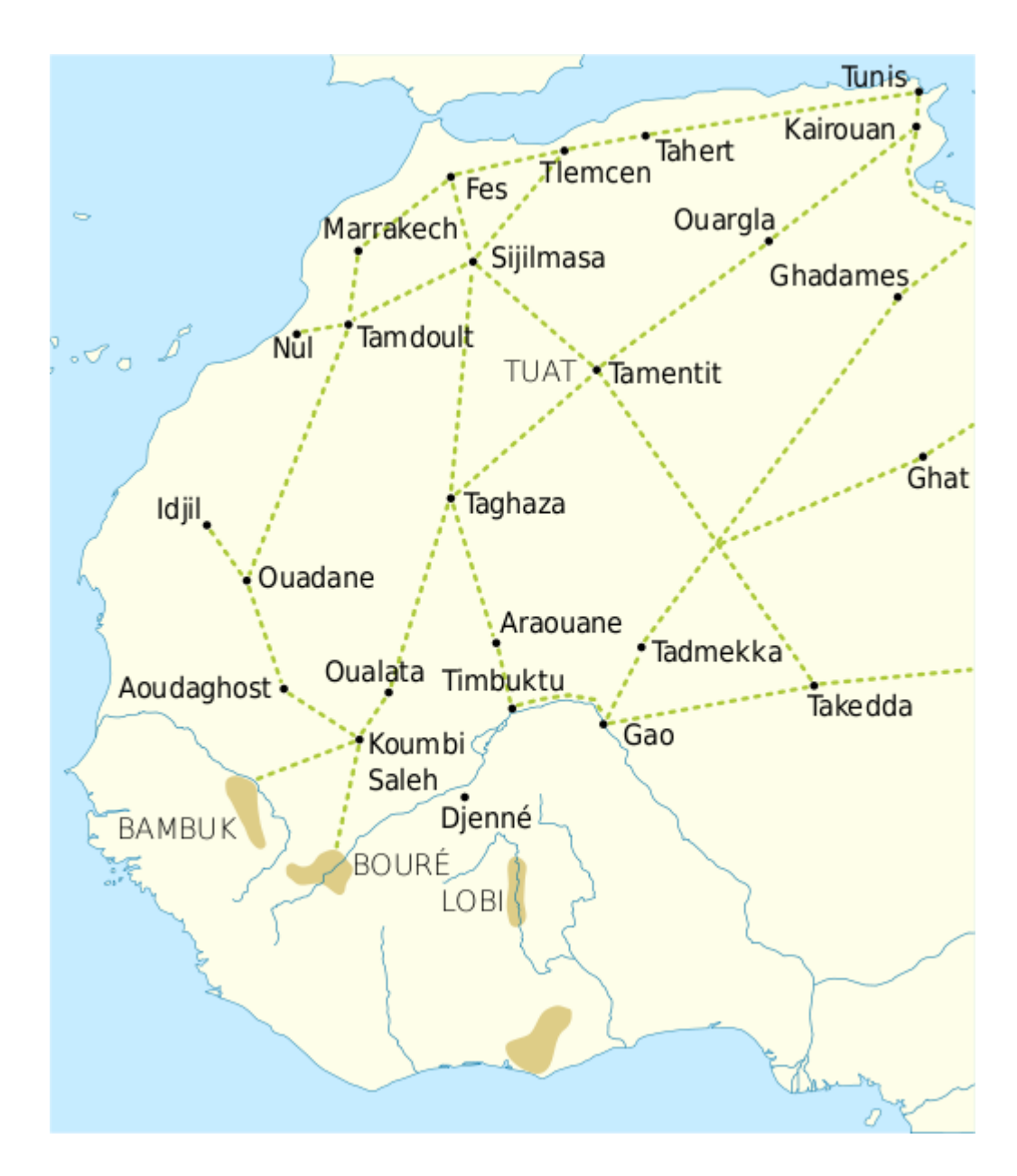
Map 3: Trans-Saharan Trade Routes