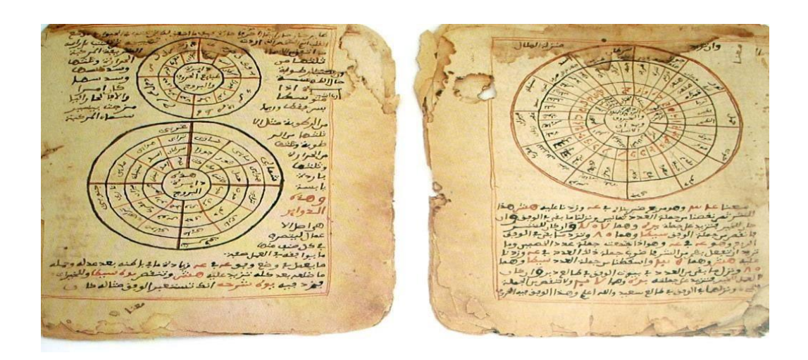
Figure 2: Sample of Timbuktu's Manuscripts